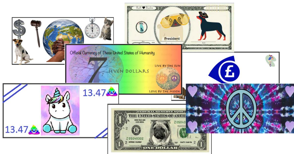
FIGURE 1: PUBLIC GOODS EXPERIMENT SAMPLE CURRENCY